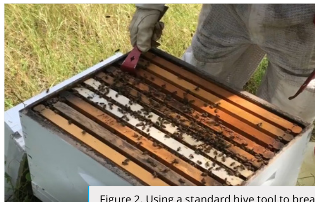
Figure 2. Using a standard hive tool to break propolis between frames

A smoker (Fig. 4) is arguably the second most important tool for a beekeeper. Smoke blocks the honey bees' ability to sense pheromones, which are detected by the antennae. Alarm pheromones can elicit an aggressive reaction in the bees, and smoking calms them. It also forces them lower into the box, leaving fewer bees in the way as beekeepers pull and inspect frames.