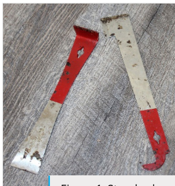
Figure 1. Standard and J-hook hive tool

First and foremost, a hive tool (Fig. 1) is a must for beekeeping. Hive tools allow the beekeeper to break propolis—a substance bees produce from wax and tree resin to seal up their home. Propolis is extremely sticky, and worker bees propolize any space too small for them to fit through.