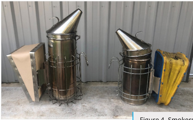
Figure 4. Smokers

Smokers have plastic and leather bellows, tall and shorter smoke chambers, round and cone-shaped tops, and come with or without heat shields. The only recommendation this factsheet will make is to purchase a smoker with a heat shield to prevent burning yourself and/or the bee suit. Always make sure the fire in the smoker is completely out before walking away from it— especially before putting it inside a closed vehicle. Smokers have a tendency to reignite.