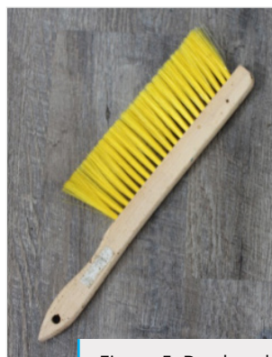
Figure 5. Bee brush

Many beekeepers also use bee brushes (Fig. 5), which are useful for moving bees off of frames or boxes to prevent smashing bees when viewing the frames. Brushes are also