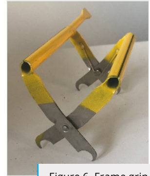
Figure 6. Frame grip

A frame grip (Fig. 6) is a useful tool, especially when working the bees alone. Frame grips allow the beekeeper to pick up the frame with one hand, leaving the other hand free and make picking up heavy frames easier. When a beekeeper is using only their hands, they will need both to pick up a single frame. Frame grips can come with a small hive tool welded to the end, making them an all-in-one tool.