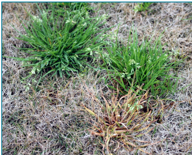
Figure 3. Annual bluegrass plants that appear to be resistant to ALS-inhibitors (Revolver, Monument, etc.) The plant showing injury is susceptible while the two noninjured plants appear to be resistant.

displaying herbicide injury symptoms among unaffected plants is an indicator that plants may be herbicide resistant (Fig. 3). However, before assuming that weed survival (escapes) are due to resistance, remember that herbicide applications can also fail due to growth stage, application rate, uniformity, coverage, timing, temperature, etc.