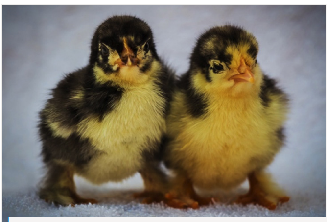
Figure 2: Children have a higher risk of contracting Salmonella and should not handle chicks or other live poultry.