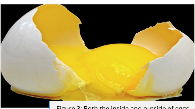
Figure 3: Both the inside and outside of eggs may be contaminated with Salmonella.

A: No. The eggs poultry produce can also be contaminated with Salmonella (Fig. 3). Poultry may carry bacteria such as Salmonella that can contaminate the inside of eggs before the shells are formed. Eggs can also become contaminated from