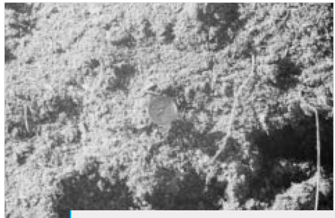
The 139-degree F reading on this long-stemmed thermometer confirms that thermophilic composting is underway.

Measure temperatures at least daily for the first week after the compost has been turned. Then, if temperatures in active bins are in the thermophilic range between 130 degrees and 160 degrees F, you won't need to measure temperatures as frequently; weekly may be adequate. Temperatures immediately after turning and wetting obviously will be near air temperature, but they should rebound markedly within 48 hours. Keep the temperature measurements in a handy file to help document to prospective buyers that weed seeds and pathogens should not be a problem in your compost.