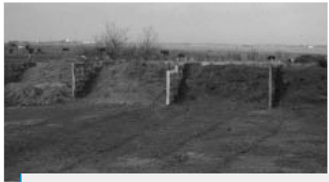
A simple, well-managed composting system is visually appealing and is unlikely to cause water quality problems.

The number and size of composting bins are determined by the amount of manure generated by the facility and the desired turning frequency. Establish a desired turning frequency of 2 to 3 weeks. Count the number of wheelbarrow loads of manure generated over that period of time. Estimate the capacity of each wheelbarrow load and multiply that by the number of loads to obtain the necessary bin volume. Then, to ensure adequate capacity for an increase in stocking rates, add another 50 percent of the volume.