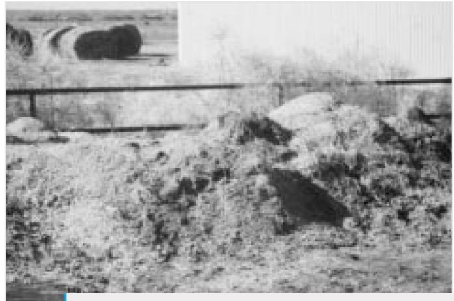
This stockpile of horse manure, straw and wood shavings is unsightly and, if uncontrolled, poses a threat to water quality in nearby streams and ponds.

climates. By contrast, a purely chemical oxidation of organic material is generally known as “combustion.” (Needless to say, we don’t want that to occur!)