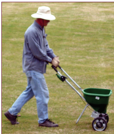
Lawn application treatment for fire ants using a push spreader.

Always read and follow the application instructions on the label of the product you are using. Use a handheld spreader/seeder for baits that are applied at very low rates such as 1 to 5 pounds of product per acre. Use the push-type spreader for baits that are applied at higher volumes per acre (2 to 5 pounds per 5000 square feet). Use