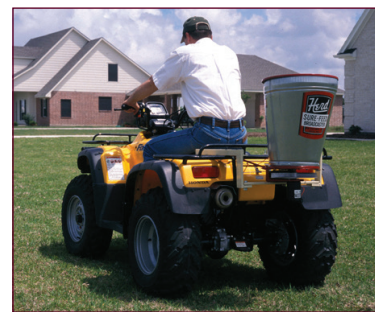
Fire ant treatment on lawn area using a spreader mounted on an ATV.

With this approach, a contact insecticide is applied to the lawn and landscape surface. This is more expensive than other control methods but it may be more effective in smaller areas because ants that move into treated areas will be eliminated as long as the chem-