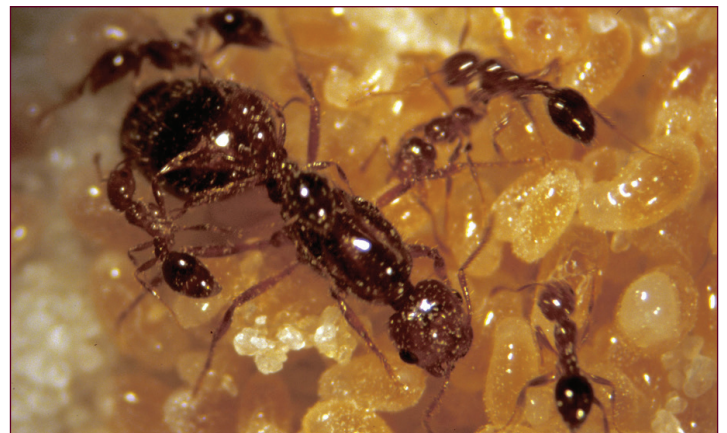
Fire ant queen (largest) surrounded by workers and eggs.

Worker fire ants are dark reddish-brown with shiny black abdomens, and vary in size from about 1/16- to about 1/4-inch long. Fire ants are similar in appearance to many other ants, so make sure you have correctly identified the species before attempting to solve your ant problem (see Imported Fire Ants: What Are Fire Ants? ). If you are uncertain about the species, call your local Extension office.