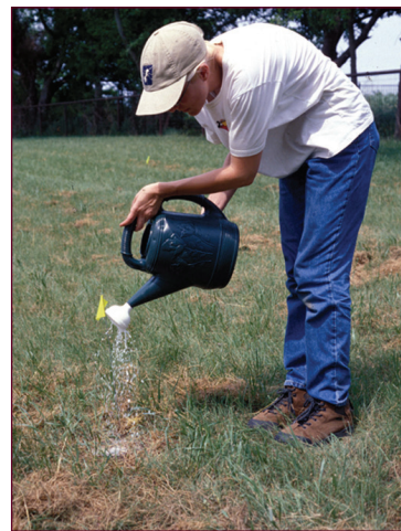
Individual mound treatment for fire ants.