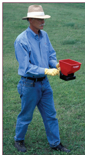
Handheld spreader application for fire ant treatment.

Baits contain active ingredients dissolved in a substance ants eat or drink. Some bait ingredients affect the nervous system. Many of these