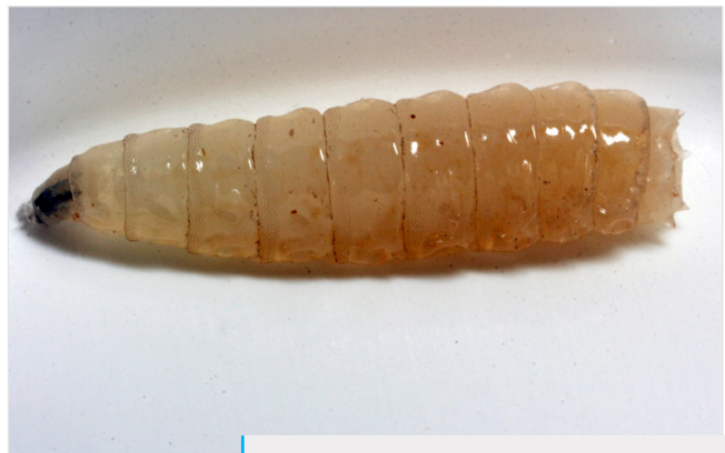
Figure 9. Blow fly maggots may wander into living spaces of homes prior to their change into an adult fly.