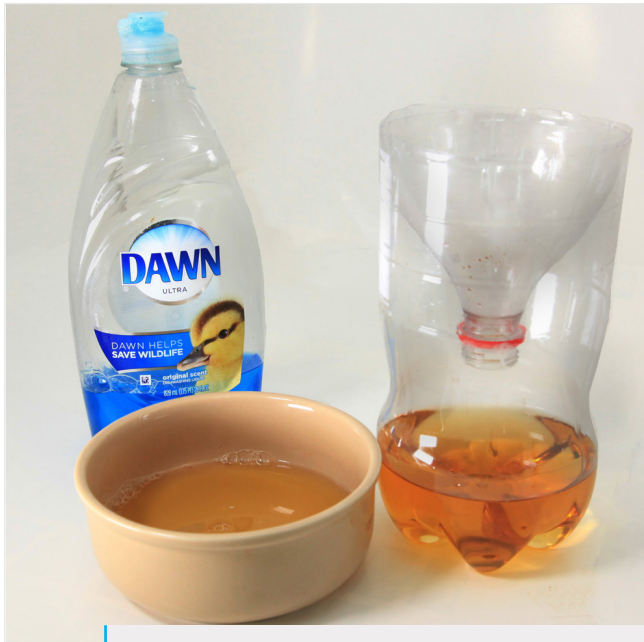
Figure 11. Inexpensive fruit fly traps can be made with readily available items. An open bowl with a liquid attractant and small amount soap will catch lots of flies (soap breaks the liquid surface tension, causing landing flies to drown). Another effective trap can be made by cutting off the top (funnel section) of a 2 liter soft drink bottle. By inverting the top inside the base you create a funnel trap into which fruit flies can fly, but not easily escape. Good attractants include apple cider vinegar, red wine, beer, or just sugar water and yeast.

Once the fly-breeding areas are cleaned or eliminated, you should not need to use insecticides. However, insecticides are sometimes helpful to knock down remaining adult flies, or to help control flies that come in from other locations.