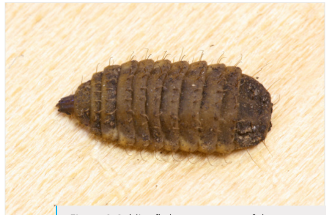
Figure 6. Soldier fly larvae are one of the strangest looking insects likely to be found indoors. They are most commonly associated with compost bins or a dead animal in the structure.

Soldier flies (Family Stratiomyidae) are outdoor flies that occasionally enter homes and buildings. Indoors, these flies are most commonly seen as full-grown larvae that have completed feeding and are searching for a place to develop (pupate) into an adult. During this wandering phase, soldier fly larvae may travel several yards from their breeding site, and may be seen wriggling along a floor, patio, or fireplace hearth. Soldier fly larvae are about 1 inch long, legless, grey to dark brown, and flattened. The “skin” is has a distinctive, leathery texture. Though not harmful, most people would consider the presence of these tough-skinned larvae indoors to be objectionable. Control involves finding and eliminating the food source. Breeding sites include rotting organic matter, such as spoiled grain, dead birds or other animals in an attic or chimney, or a decaying bee nest in a wall. Indoor worm compost bins have been known to harbor soldier flies.