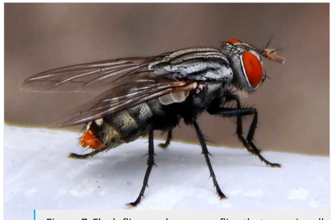
Figure 7. Flesh flies are large gray flies that occasionally enter homes when attracted by the odor of a dead animal in an attic, chimney, or wall.