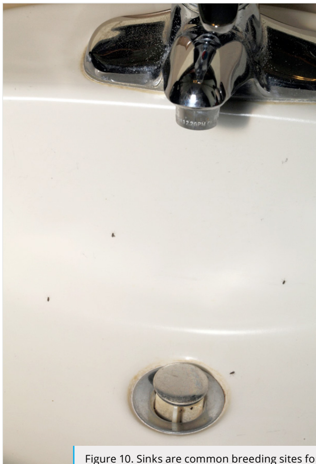
Figure 10. Sinks are common breeding sites for moth flies and fungus gnats.

To check whether a drain is breeding site, place a length of clear packing tape across the drain without totally covering the opening. If you cover the opening completely, there will be no airflow and flies may not