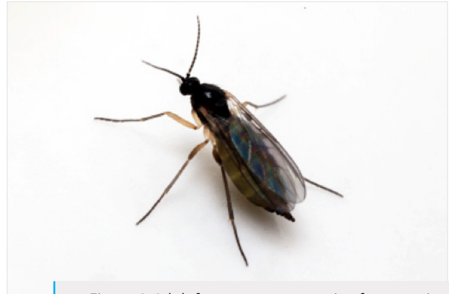
Figure 4. Adult fungus gnats emerging from potting plants do not bite, but can be highly annoying indoors.

Fungus gnats (Families Mycetophilidae and Sciaridae) are very small (1/16 to 1/8 in, 1.5 to 3 mm), slender flies with clear or dark wings. They are mosquito like, with long slender legs and bead-like antennae—though much smaller than mosquitoes. Also, unlike mosquitoes, fungus gnats do not bite, though they can be a nuisance when flying around one’s face or in front of a computer screen.