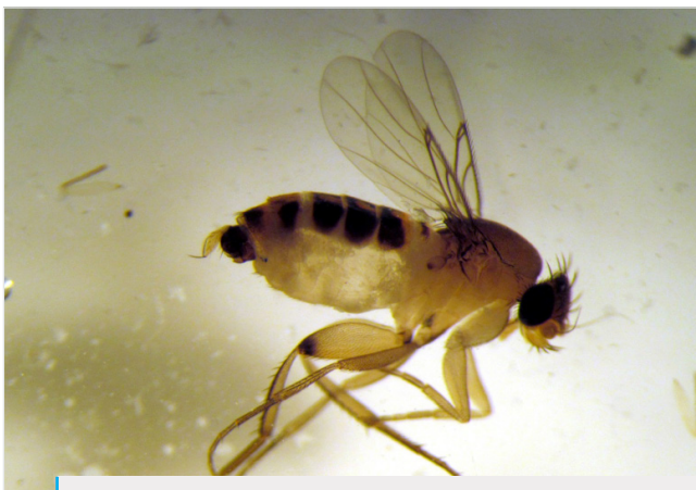
Figure 2. Phorid flies are similar in size to fruit flies, but are humpbacked, with strong veins along the front edge of the wings. These flies frequently run or hop rather than fly, as suggested by their enlarged femur in the hind pair of legs.

Fruit flies can be controlled by taking out the trash or removing unrefrigerated, overripe fruit, or rotting vegetables. Locating and eliminating other breeding sites can sometimes be more challenging. Using traps or sprays may provide temporary relief from fruit flies, but eliminating the breeding site is essential for complete control.