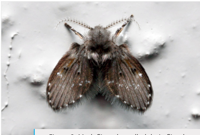
Figure 3. Moth flies, also called drain flies, breed in microbial films that grow in drains. These moths are often seen resting on walls near the drains from which they emerge.

Adult drain flies are small (1/16 to 1/5 in, 2 to 5 mm), greyish, and densely covered with hairs. They hold their broad wings either flat or like a roof over the body at rest. Drain flies usually fly only a few feet at a time.