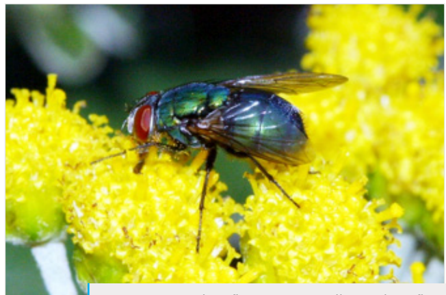
Figure 8. Blow flies are normally outdoor flies, but will enter homes to lay eggs on dead rodents, birds or other carrion.