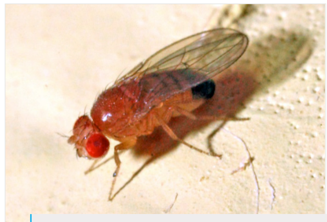
Figure 1. Fruit flies are one of the most well studied insects because of their usefulness in genetics research. Their stocky bodies and red eyes help distinguish fruit flies from other small indoor flies.

Fruit flies (Family Drosophilidae) are common indoors and out. Infestations are most frequent during the summer when fruit flies are active outdoors—though indoor infestations are possible any time of year. Fruit flies are approximately 1/8 inch long (2 to 4 mm) with a stout, cylindrical body. They usually have reddish eyes. They are small enough to pass through window screens and can easily enter through open doors or windows. They can be distinguished from other small indoor flies by the feathery bristle (arista) on the tip of their third antennal segment.